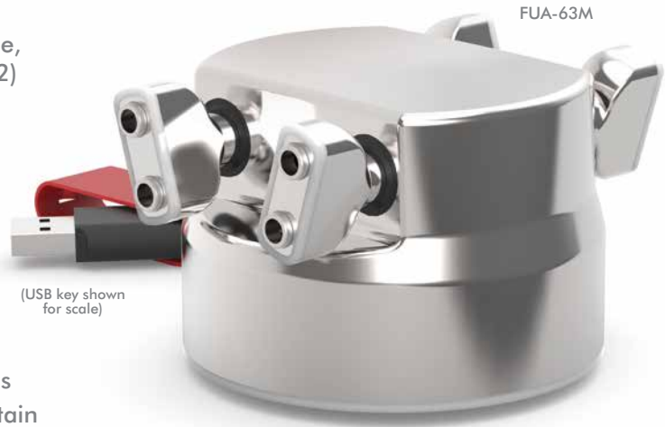
(USB key shown for scale)